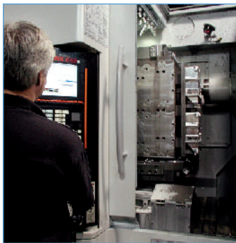
Elimetal's new Mazak PFH-5800

Elimetal begins production of wireless military communication components utilizing new Mazak PFH-5800